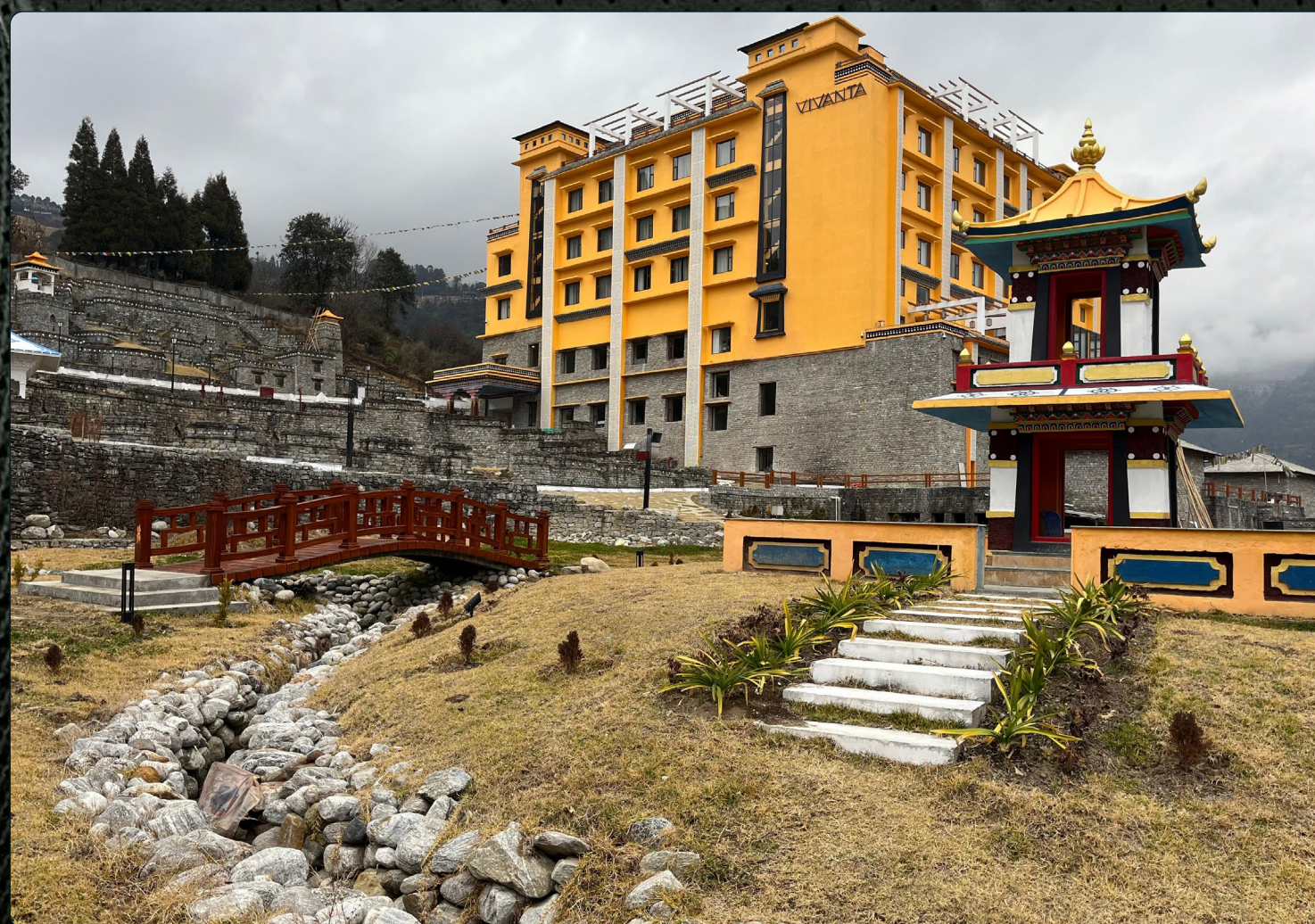
Vivanta Arunachal Pradesh