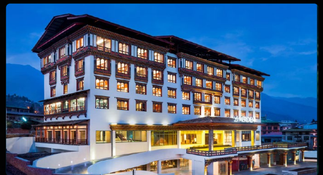
Le Méridien Thimphu