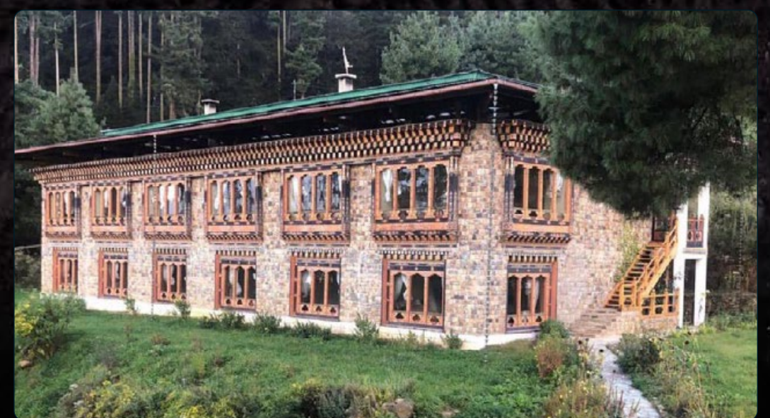
Dewachen Hotel, Phobjikha