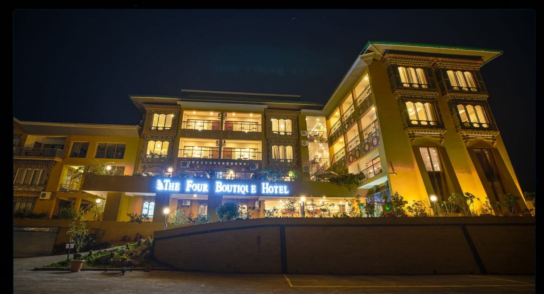
The Four Boutique Hotel