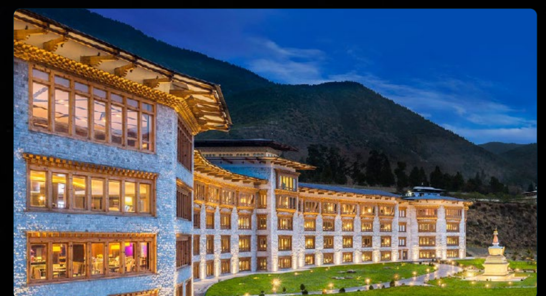
Le Méridien Paro